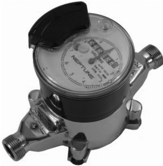
Typical Water Meter

Take this sheet to the water meter in your home or business. Meters are usually located in the basement at the wall nearest the street. Fill in the blank spaces on the register diagram with the numbers as they appear on the meter.